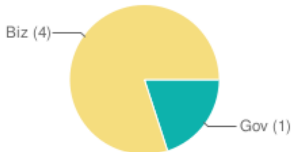
Incidents By Sector