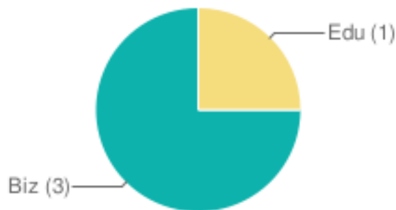
Incidents By Sector